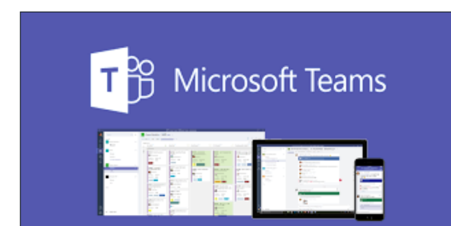
Figure 1. Microsoft Teams

The instructor found that students don't often enjoy group work. Introducing a new platform and empowering students to engage in virtual group work using theories learned in class was her way of changing the traditional group work practices of students. While there are many functions of Microsoft Teams, the class focused on communication within the virtual team and sharing of documents.