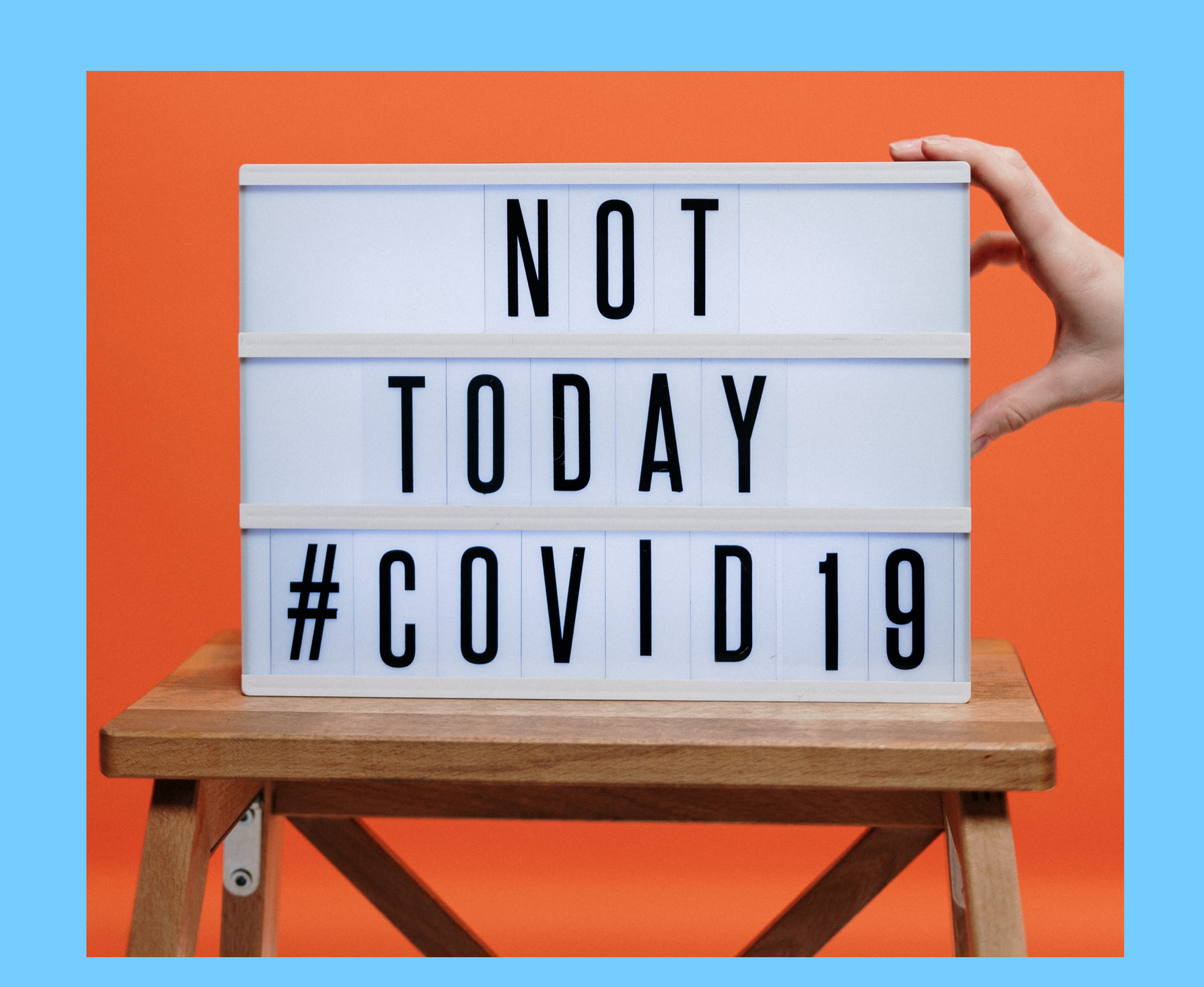
The HyFlex approach is very "pandemic-friendly" as well as flexible for "regular" times