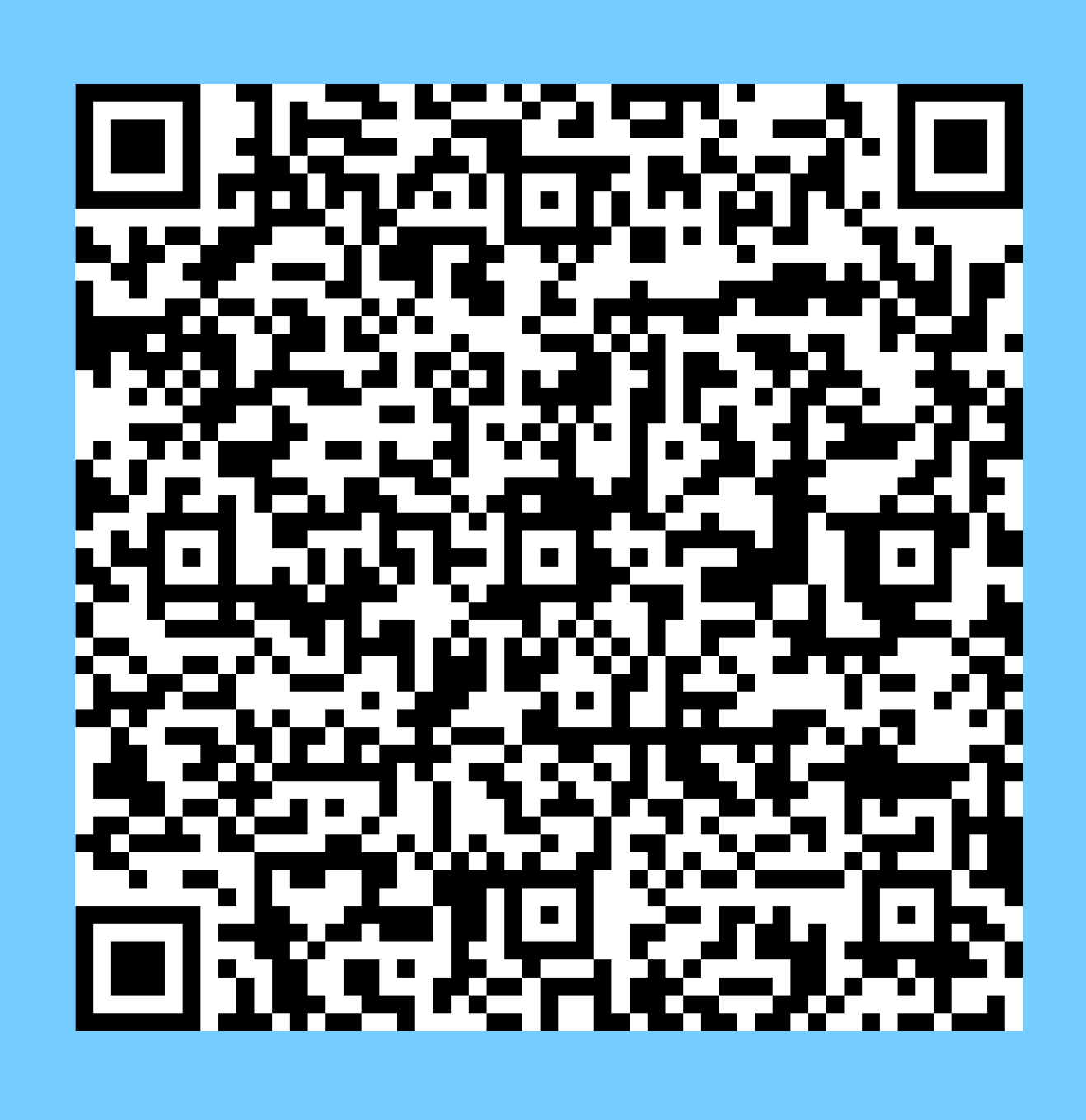
QR Code for this presentation