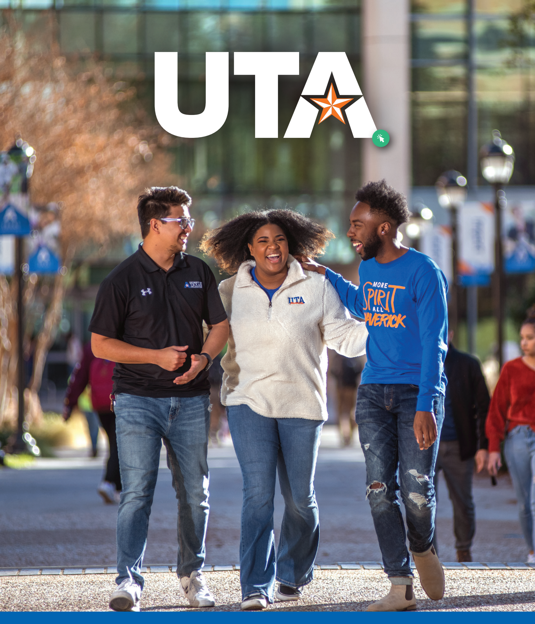
THE UNIVERSITY OF TEXAS AT ARLINGTON