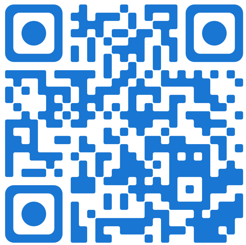
ENERGY TRANSITION AND RESILIENCE PLAN SURVEY

University Center, Red River and Concho Rooms