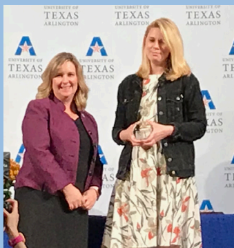
UTA Leadership Award Ceremony