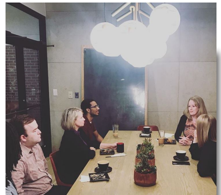
APA MWT Lattes & Leadership