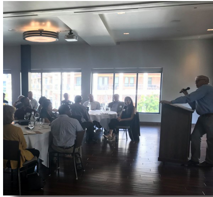
APA MWT Award Ceremony