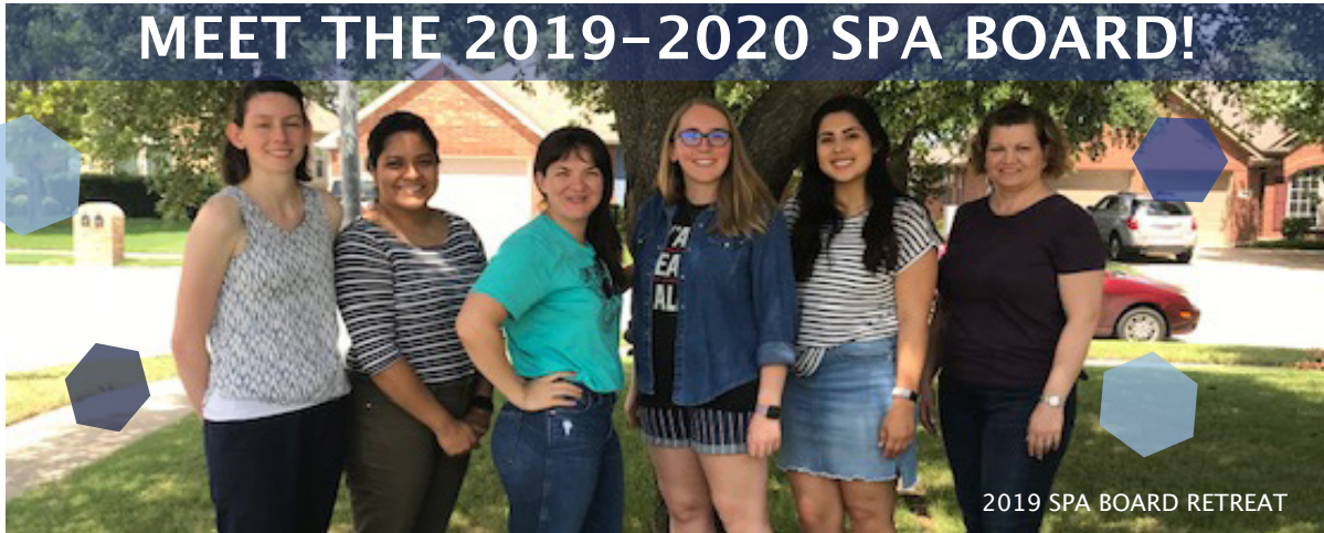
2019 SPA BOARD RETREAT