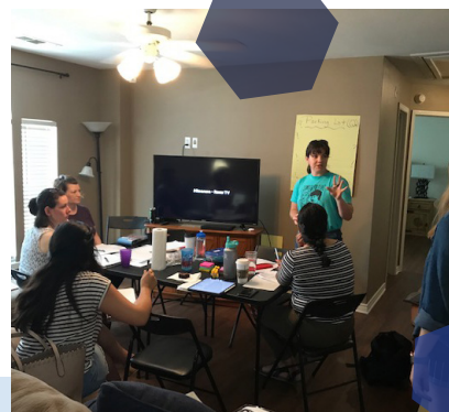
2019 SPA BOARD RETREAT