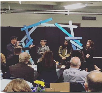
City Lab High School Summit

City of Arlington: Part-time Planning Tech/ Short-term Rentals Planning and Development