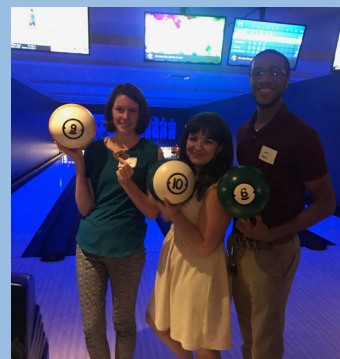
APA MWT Award Ceremony Bowling Social