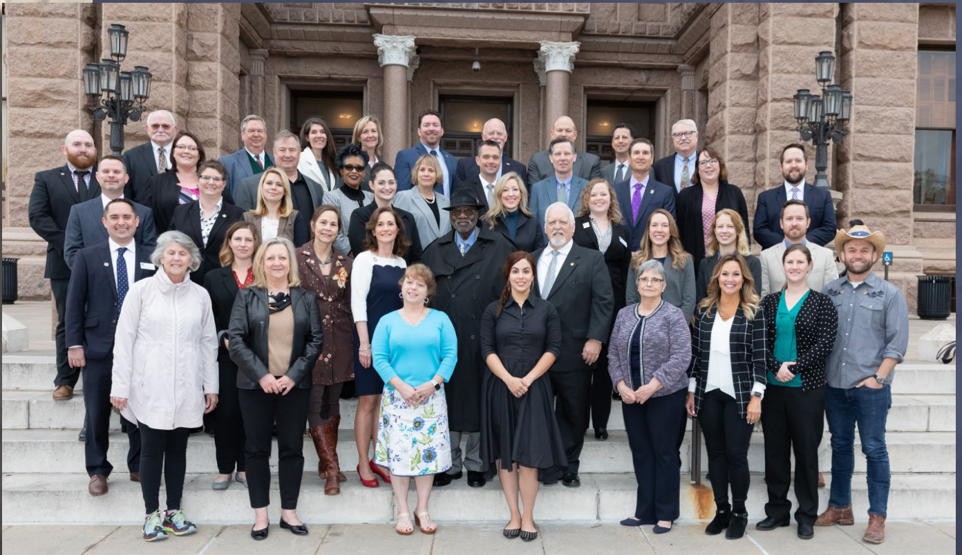
American Planning Association, Texas Chapter 2019 Planners' Day at the Texas State Capitol