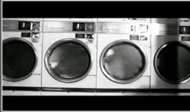
Spin Cycle | Clinton Rawls