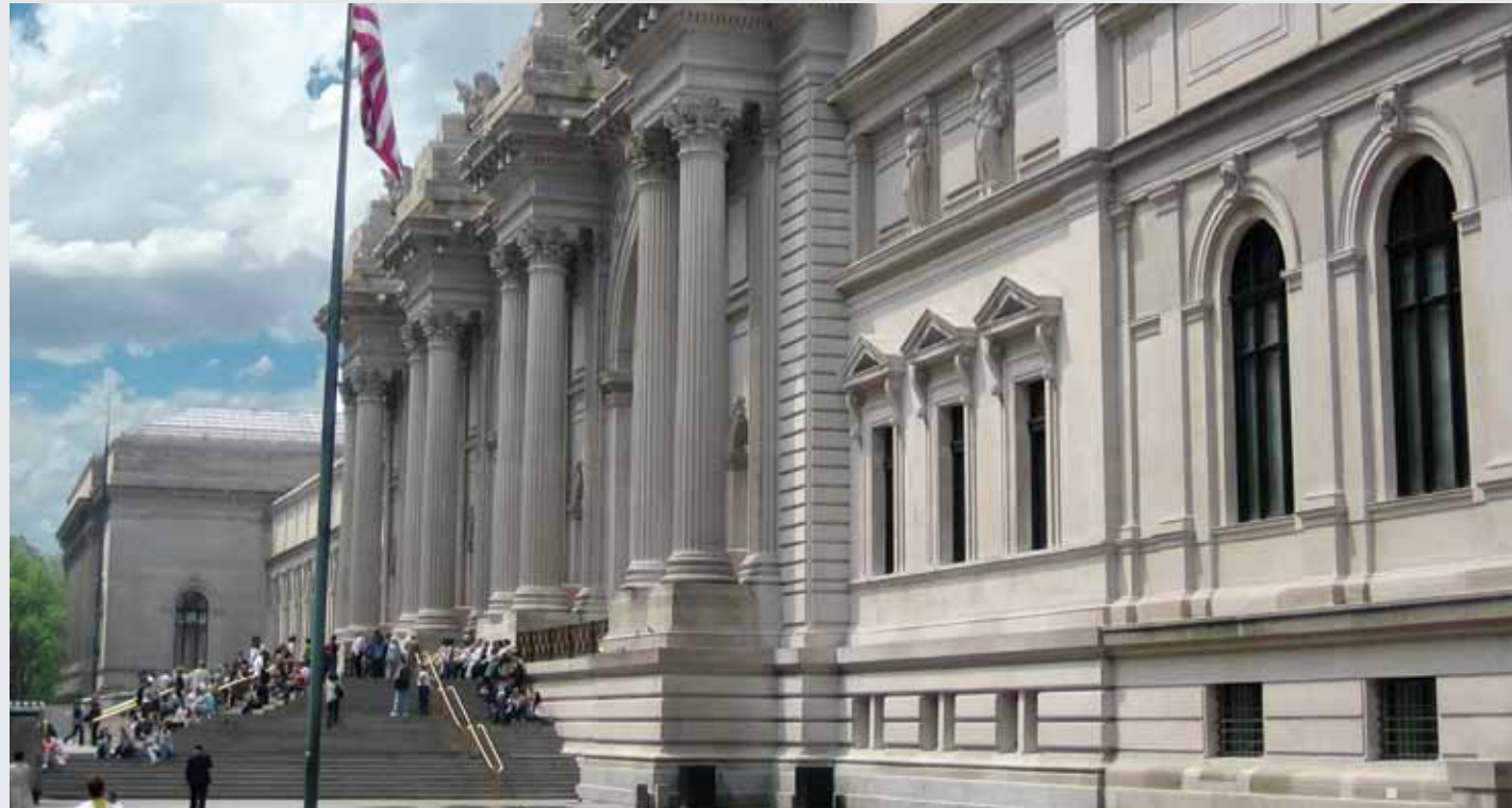
Metropolitan Museum of Art in New York