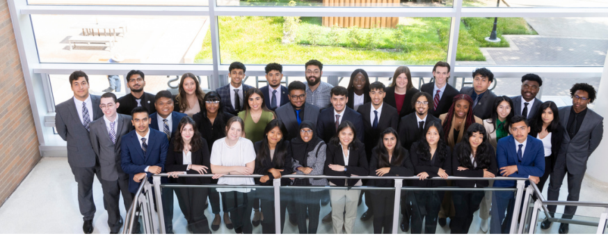
WELCOME COHORT 20!

Welcome Cohort 20, We are excited to have you become a part of our community of emerging leaders, beginning a lifelong journey of personal growth, education, and self-discovery. You are from diverse backgrounds, nationalities, majors, and ethnicities; 57.6% are first-generation. Your leadership is not defined by one characteristic or quality. Have a wonderful semester, and continue to work towards your goals with intention.