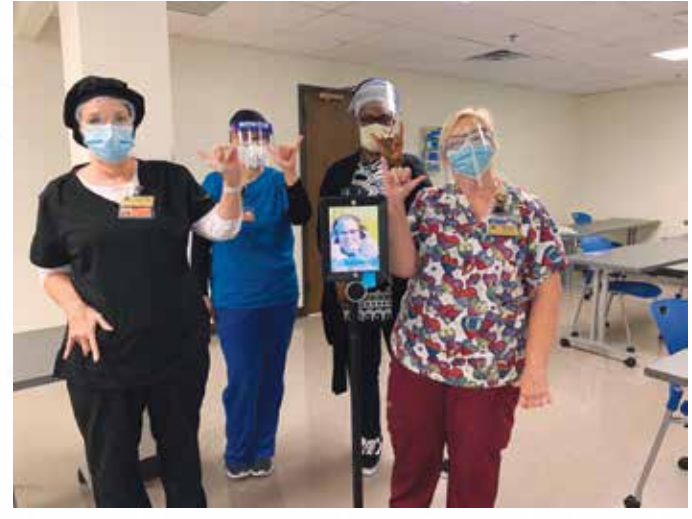
Junior 1 faculty take a break to share their Mav Spirit in the Smart Hospital.

The 2021 Community Action Poverty simulation also will go virtual and will be one of the largest simulation events at CONHI. Typically, at this in-person event students simulate the experience of what life is like at or below the poverty line, including interacting with community services, food banks, health care, and more. It also will be the first time the simulation is able to include Accelerated Online students who previously did not participate because it was an inperson event.