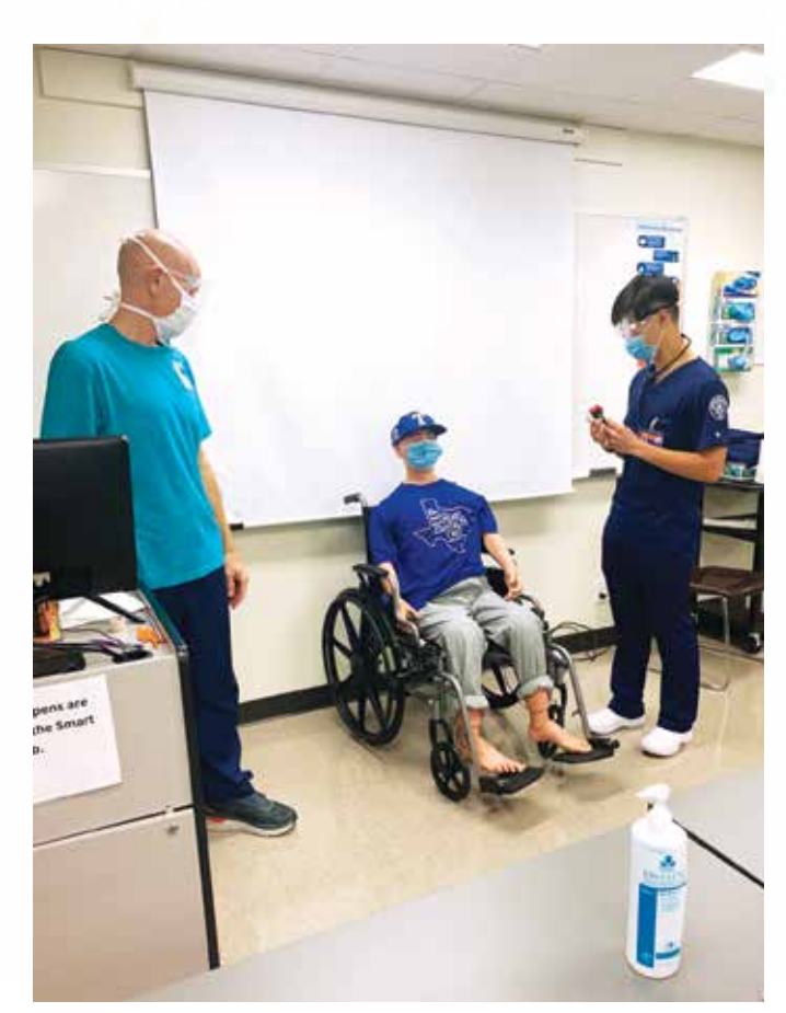
Nursing students practice taking a history and therapeutic communication with artificial intelligence mannequin "Alex."

In-person training at the Smart Hospital has been carefully limited to decrease the risk of COVID-19, such as through physical distancing requirements and room capacity limitations. The new precautions have limited the number of students who can be on-site at any one time.