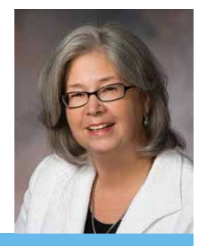
From the Dean

The athletic trainer program in the Department of Kinesiology is accredited by the Commission on Accreditation of Athletic Training Education.