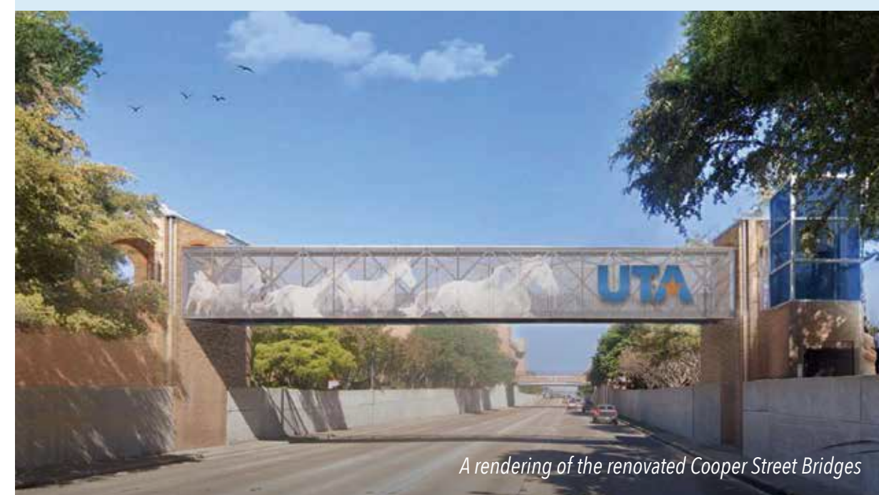
A rendering of the renovated Cooper Street Bridges

Learn more about campus construction project at uta.edu/campus-ops/progress .