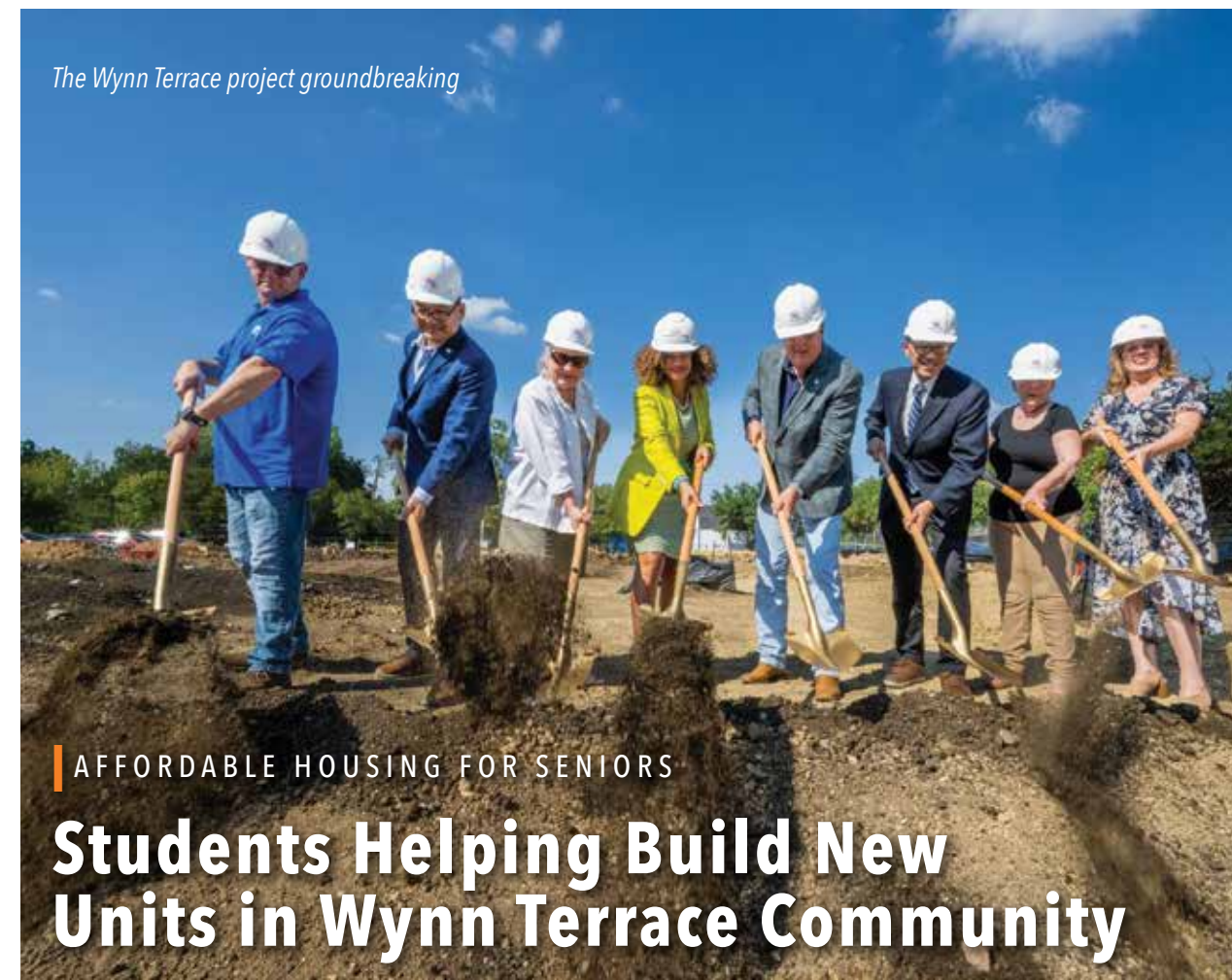
The Wynn Terrace project groundbreaking