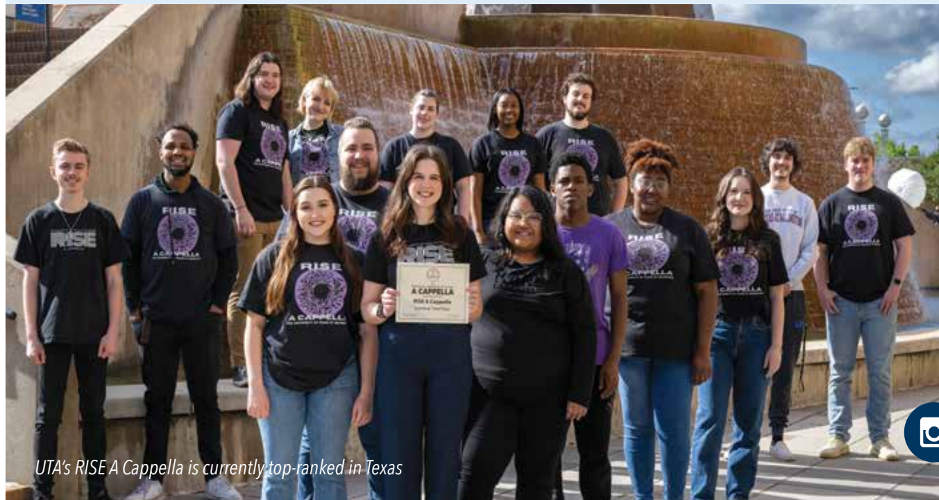
UTA's RISE A Cappella is currently top-ranked in Texas