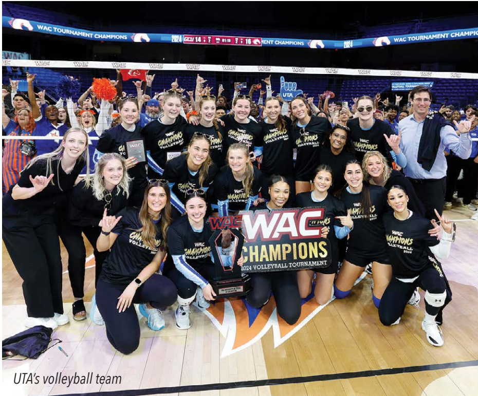
UTA's volleyball team

And, of course, there is always plenty of coffee available.