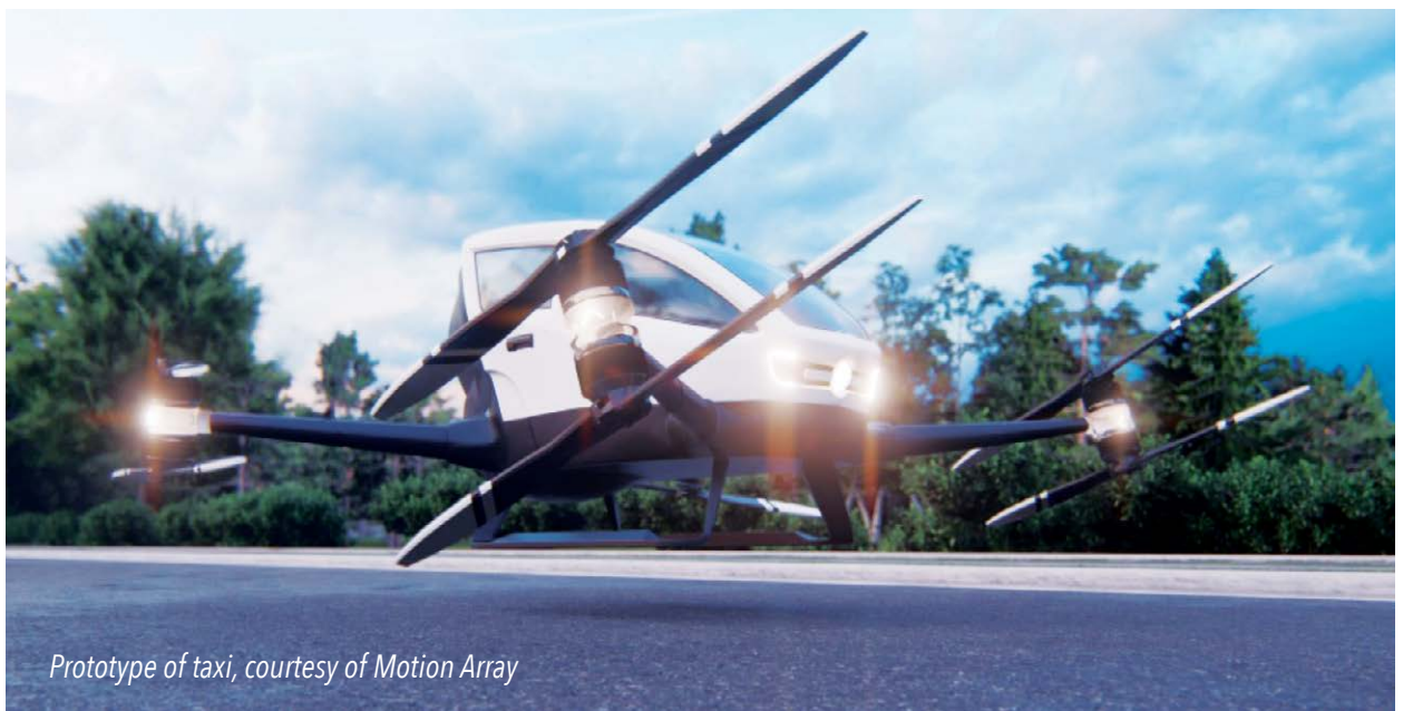
Prototype of taxi, courtesy of Motion Array

R1 classification signals that an institution is considered a top-tier research university with a significant commitment to producing groundbreaking research, attracting top faculty, and securing substantial research funding—essentially placing it among the most prestigious research institutions in the country.