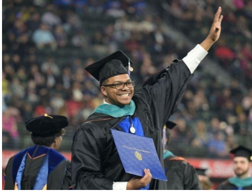
Social Work increases in national rankings