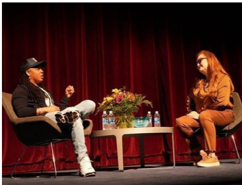
SSW hosts comedian, actress Punkie Johnson