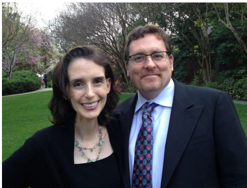
Donors honor alumna's memory through $1 million gift