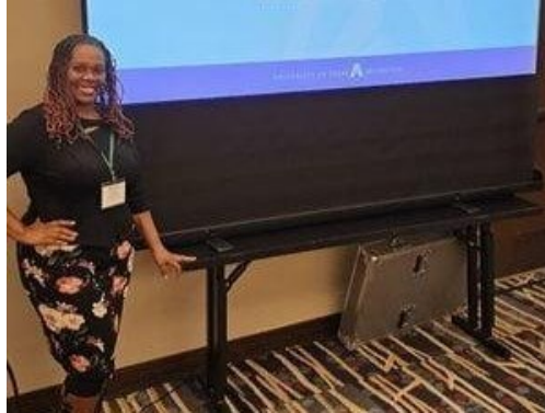
Faculty, students lead the way at SSWR conference