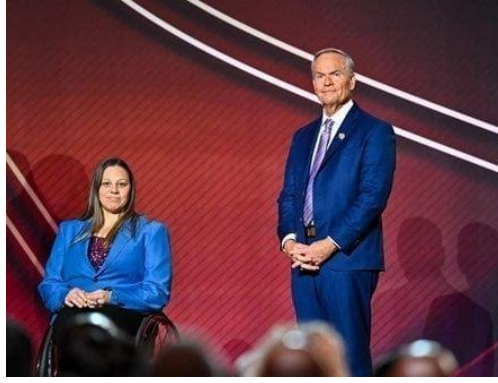
NWBA Hall of Fame inducts professor, Paralympian