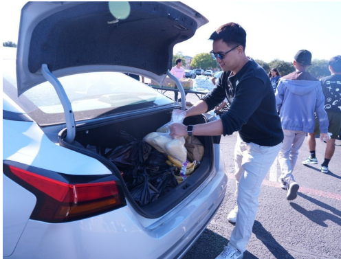
Social Work to host 5th annual food giveaway, trunk or treat