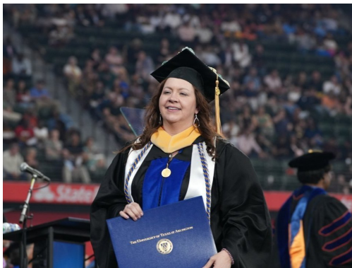
SSW graduates 216