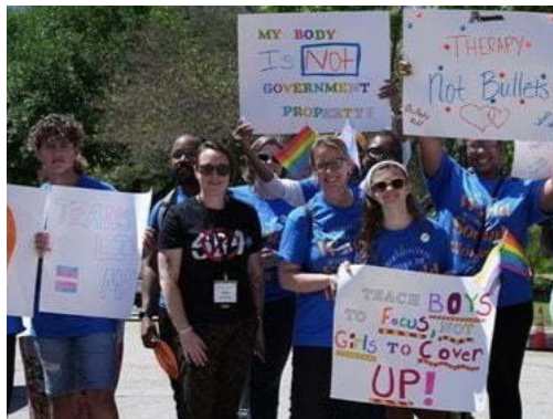
Social Work Advocacy Day 2024 Returns