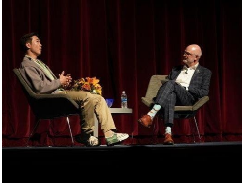
School of Social Work hosts comedian Joel Kim Booster