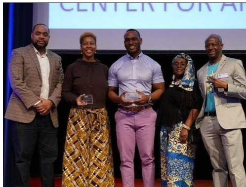
Social Work, Hip-Hop unite