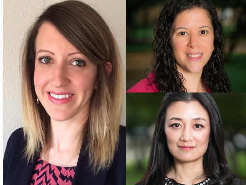
Social work professors to be honored for teaching excellence