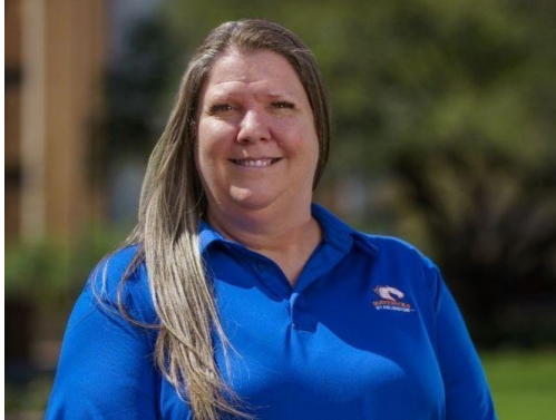
A Maverick who is deaf advocates for accessibility