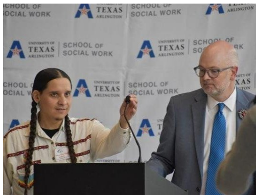
Social Work holds first alumni breakfast since COVID-19