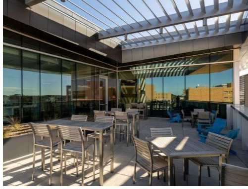
UTA awarded $100,000 gift from Hoblitzelle Foundation