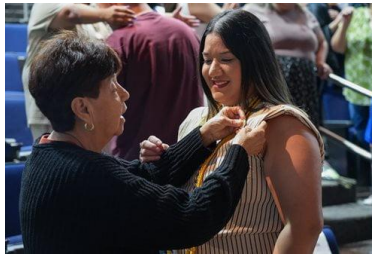
Spring 2025 SSW graduate being pinned by family member