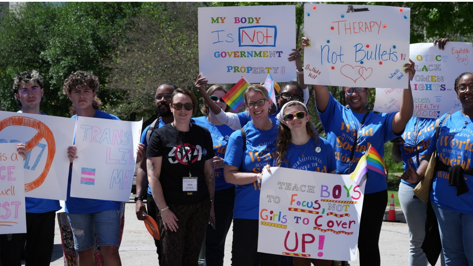
UTA School of Social Work students, staff, and faculty rallying at the State Capitol in Austin, Texas March 22.