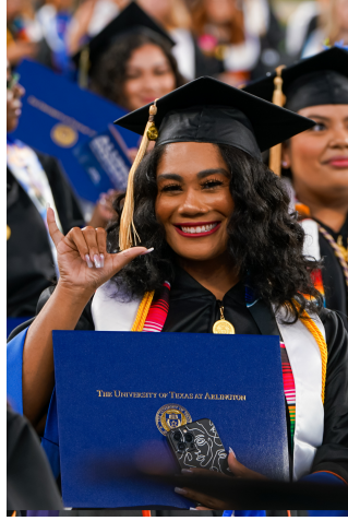
UTA School of Social Work graduate holding Mavs Up sign during the December 2023 commencement ceremony.