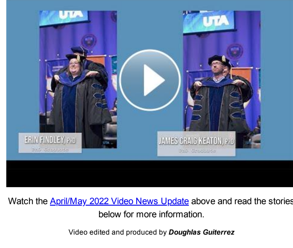
Watch the April/May 2022 Video News Update above and read the stories below for more information.