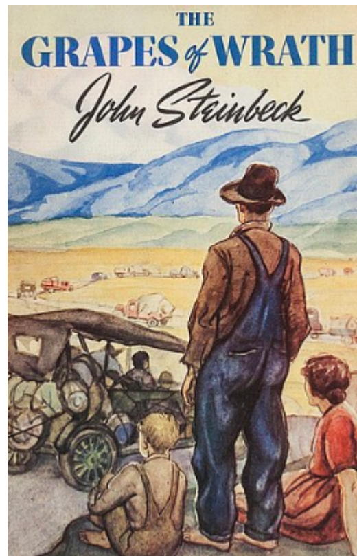
The Grapes of Wrath by John Steinbeck

The Grapes of Wrath is a story of hope and survival. The story takes place during the Great Depression, and it follows the Joads, a poor family of farmers living in the Dust Bowl in Oklahoma, who are driven from their home due to drought, economic hardship, industry changes, and bank foreclosures forcing them out of work. The story starts with Tom Joad, who was recently paroled from prison after killing a man in a bar fight. We watch Tom reconnect with his family, and put together a plan to escape Oklahoma, attempting to find a better life.