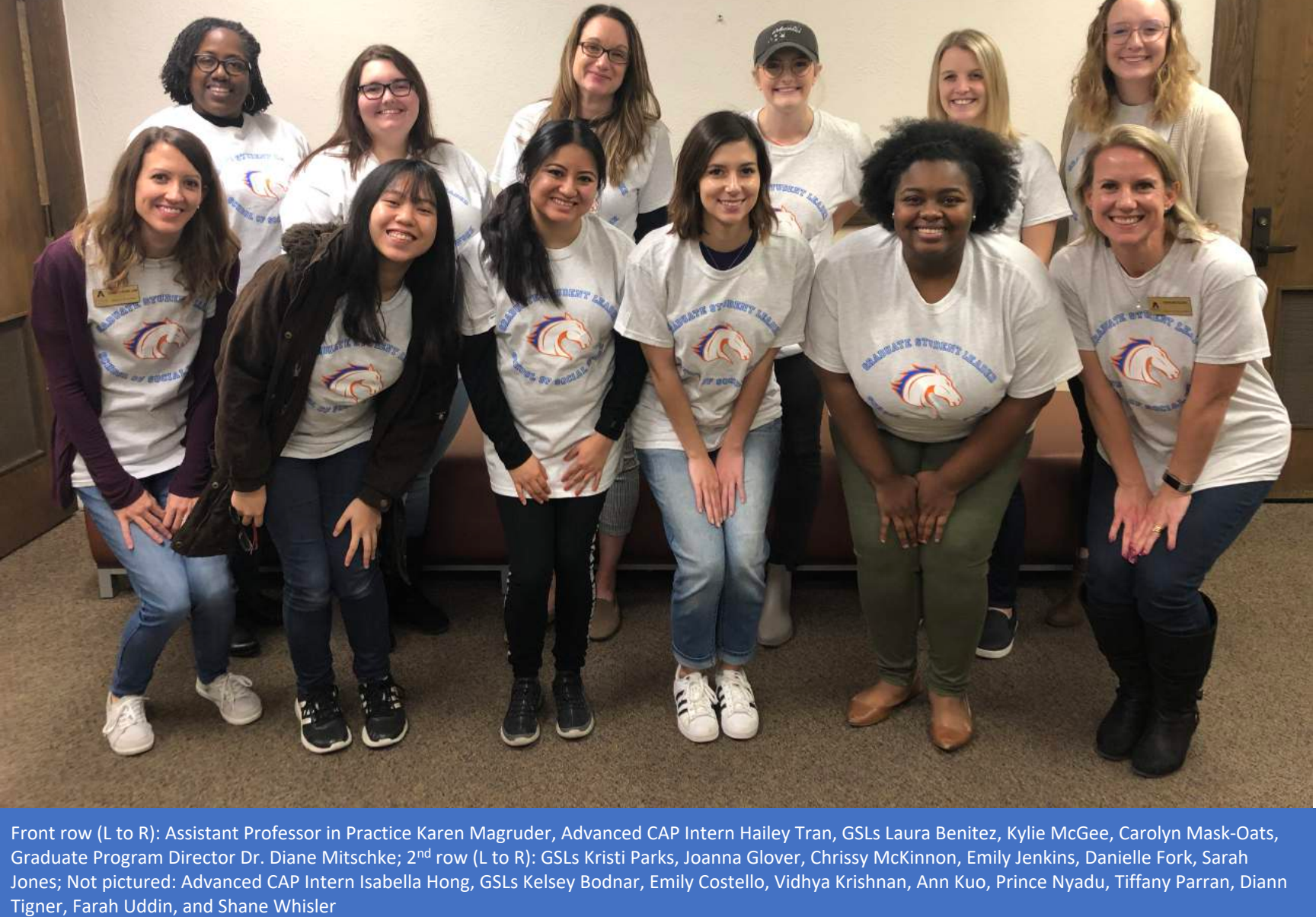
communication, facilitate connections, and build community. GSLs are trained to find answers to questions quickly and accurately, and serve as a resource and support for MSW students. Every MSW student in the program has been assigned to

The Graduate Student Leadership (GSL) Program is designed to enhance