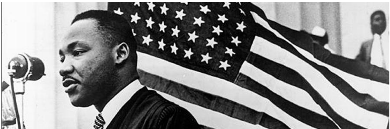
Honoring Dr. Martin Luther King Jr.

As we approach the Martin Luther King Jr. Day holiday on January 20, it's a powerful moment to reflect on Dr. King's enduring legacy in the fight for civil rights and social justice. This day not only commemorates his contributions but also